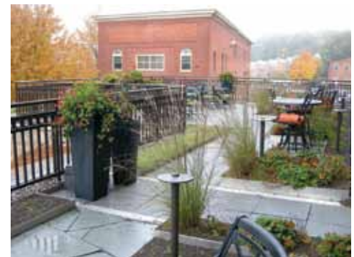
SEVENTH GENERATION GREEN ROOF