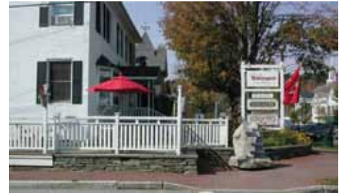
STOWE PUBLIC SPACE

We work with the existing site conditions to moderate indoor temperatures and outdoor climates, and to provide environmentally sensitive solutions for drainage and erosion concerns. Local construction materials are used to increase sustainability and provide harmony with the natural surroundings.